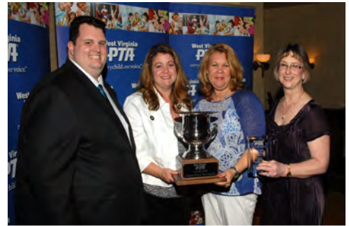
Johnson Elementary PTA being recognized as the largest PTA in West Virginia