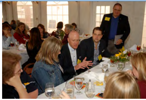
Attendees learning about Microsoft during the first-ever Speed Vending Luncheon