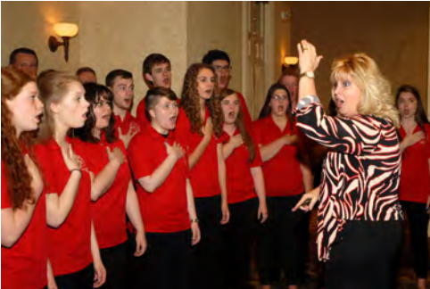
Parkersburg High School Chamber Choir singing the National Anthem