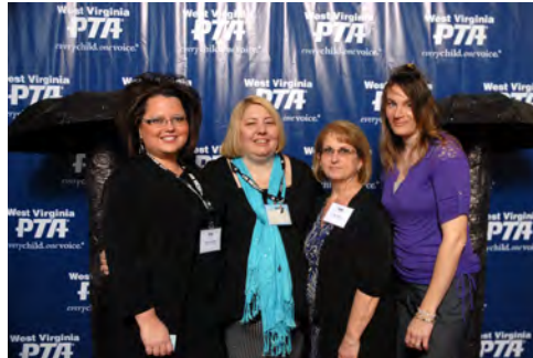
Wood County Council PTA representatives attending the Awards Banquet