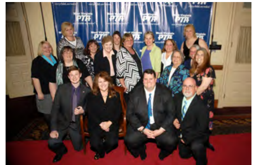
2013-2015 West Virginia PTA Board of Managers